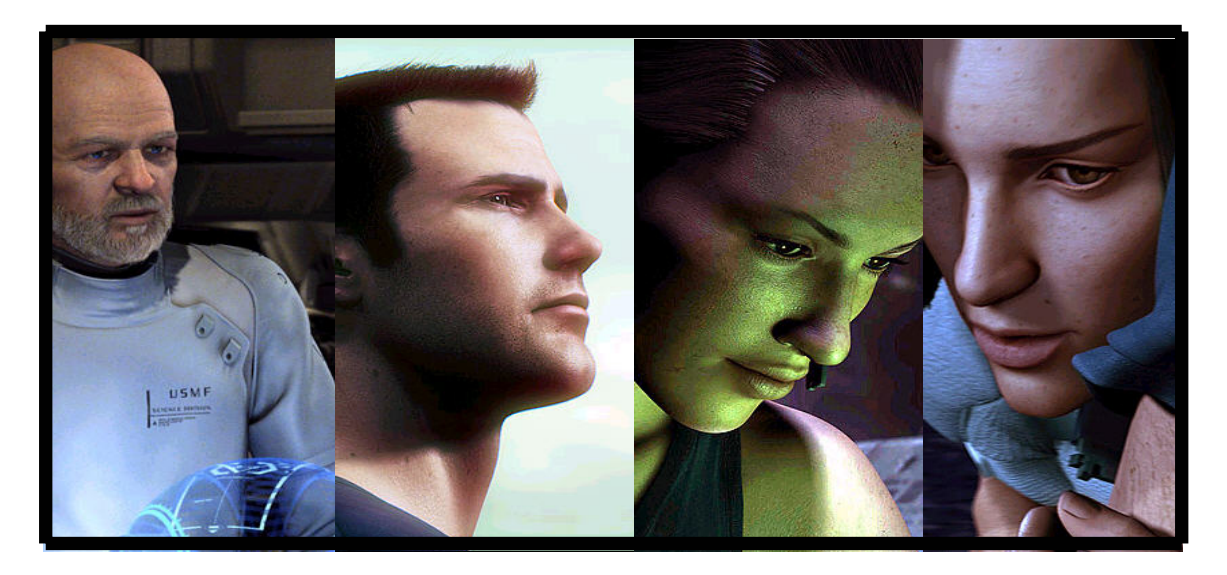
Figure 1. Computer generated images of virtual characters from Final Fantasy: The Spirits Within.

The level of technical talent, supported by state-ofthe-art equipment not typically found in homes or businesses, is imperative to the development of such an impressive replication. The Web site describes how the imagery was virtually generated from the conceptual visions of the design team: